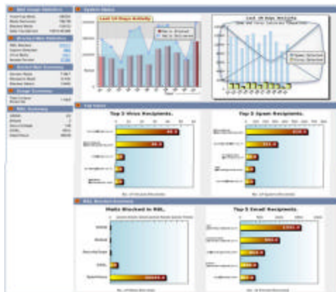
Figure 2: ECMDashboard

Emergic CleanMail provides a single interface for detailed reporting of email traffic and administrating your domain(s).